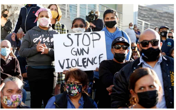
A vigil for the victims of a shooting in San Jose, California, on 27 May 2021.

Anxiety about violent crime is often used to win elections. Police and politicians routinely share misleading, out-of-context crime statistics to advance their agendas. Fear-mongering about rising crime has also been used for decades to undermine Black Americans' protests for civil rights. So it's important to ask: is this homicide increase actually significant? And how much evidence is there for any of the explanations about why killings are going up?